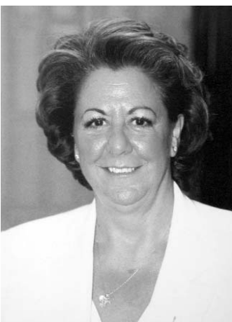
Rita Barberá Nolla Mayoress of Valencia

The Valencian people, open-minded and friendly, are happy to share our city, our projects and all opportunities offered by the city of Valencia with every one of our visitors and specially with the delegates and representatives of international businesses and institutions having special affection towards China, a country we would like to strengthen ties of friendship and cooperation with.