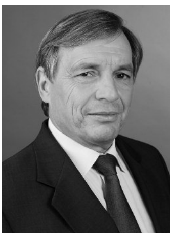
Jeannot Krecké Minister for the Economy and Foreign Trade Luxembourg

Last, but not least, I would like to take the opportunity to wish you a pleasant stay in my country and wish that you will take some time to discover the many charming facets of Luxembourg – the green heart of Europe.